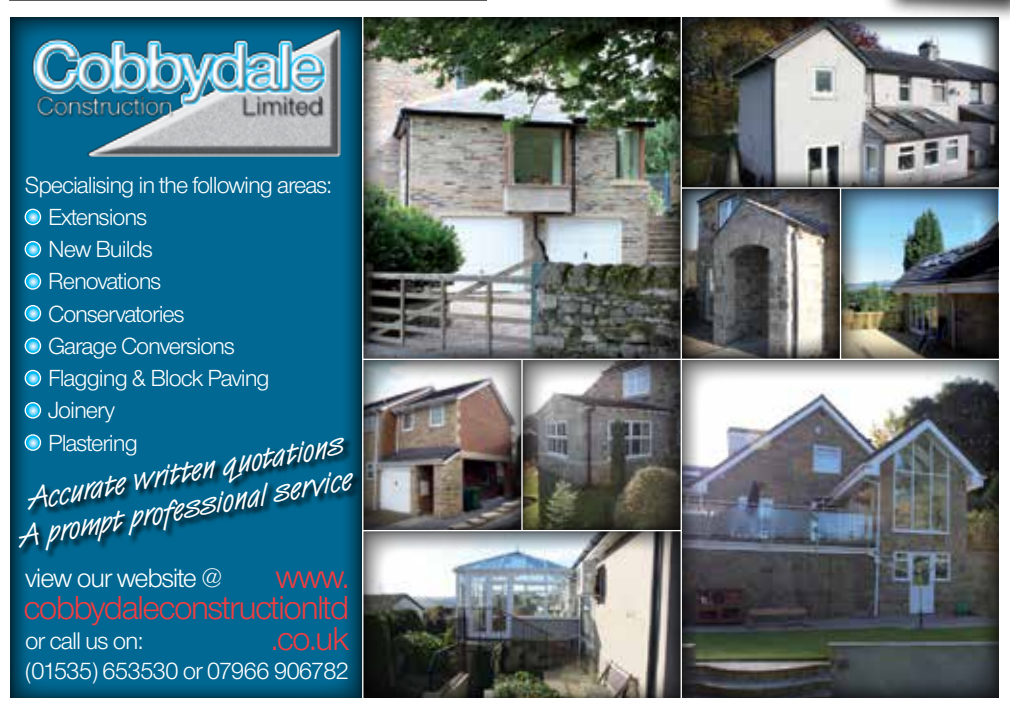
Say you saw it in the Aire Valley Mag!